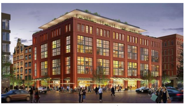
456 Lux Hotel, LP